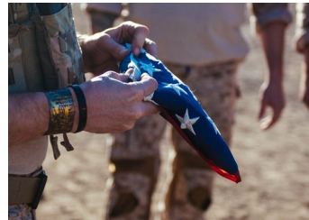
TRAGEDY ASSISTANCE AND SURVIVOR SUPPORT

Education is an integral part of an empowered life and the Navy SEAL Foundation is honored to support the educational pursuits of the Naval Special Warfare community.