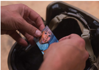
WARRIOR AND FAMILY SUPPORT

Transition can be challenging. The Navy SEAL Foundation provides opportunities and connection points for the Naval Special Warfare community, illuminating the path to a post-service career.